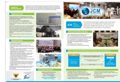
Brochures and posters