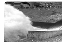
Hydro: 1 project