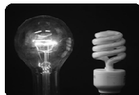
Energy Efficiency: 2 projects