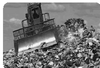
Waste-to-Energy: 5 projects