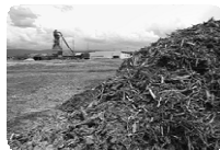
Biomass Power Plant: 10 projects