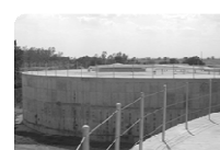
Biogas: > 40 projects